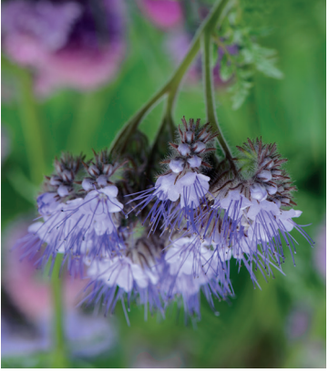
Phacelia tanacetifolia (H Rice)