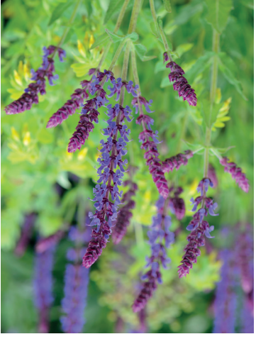
Salvia nemerosa 'Lubeca' (H Rice)