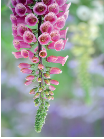
Digitalis purpurea 'Excelsior Hybrids' (H Rice)

Agastache rugosa 'Liquorice Blue' Antirrhinum braun-blanquetii Antirrhinum majus 'Liberty Lavender'