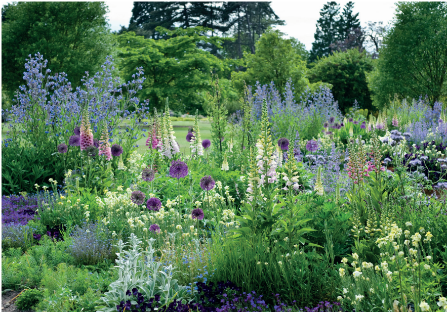
Cover images and above: Bee borders in early summer (H Rice), Allium schoenoprasum (H Rice)