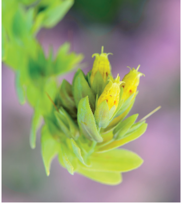
Cerintho minor (H Rice)