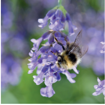
Lavandula x intermedia 'Sussex' (H Rice)

Aconitum carmichaelii 'Kilmiscott' Adenophora 'Amethyst' Bee Border Plant List 2017