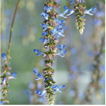
Salvia uliginosa (J Day)

Echinacea pallida Echinacea purpurea Salvia transsylvanica Salvia uliginosa Sedum 'Autumn Joy' Sedum 'Ruby Glow' Succisa pratensis Verbena bonariensis