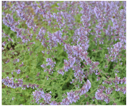
Left column: Berberis thunbergii 'Helmond Pillar' (background, in front of hedge), Stachys byzantina , Euphorbia characias subsp. wulfenii . Right column: Dryopteris filix-mas , Taxus baccata topiary, Nepeta racemosa 'Walker's Low'.